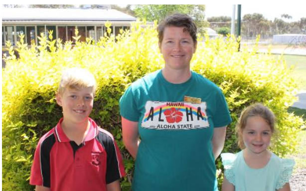
P& C Meeting