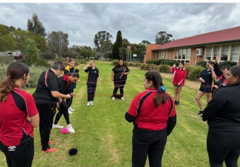
Gnalla Djooks working together