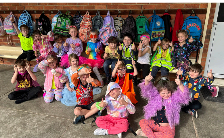
Year 1s: Sock Week Fluro Friday