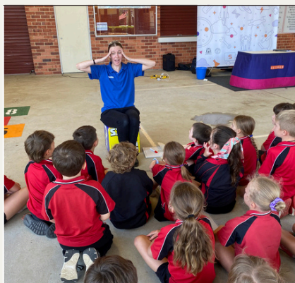
The Scitech Roadshow came to town in Week 2. The students had a fantastic day learning about all things science!