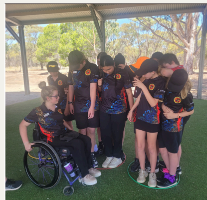
Beverley DHS Cadets doing some team building activities in Week 2.