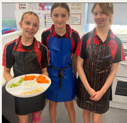
The secondary students are loving their hands-on Home-Ec classes. Here they made creamy herb dip with veggie sticks!