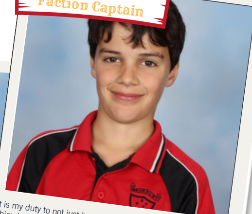
Tate Faction Captain

It is my duty to not just be on duty in the sport shed and wear a shiny badge but also voice your ideas at meetings. I am happy to listen to fellow students' ideas as they're important! Come on Forrest!