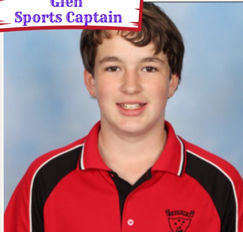
Glen Sports Captain

I am proud to be your Secondary Sport Captain. I will be as helpful as I can be in both secondary and primary areas. I hope to be very helpful in all aspects of sport, I will make sure we will have all our sport equipment ready at lunchtime.